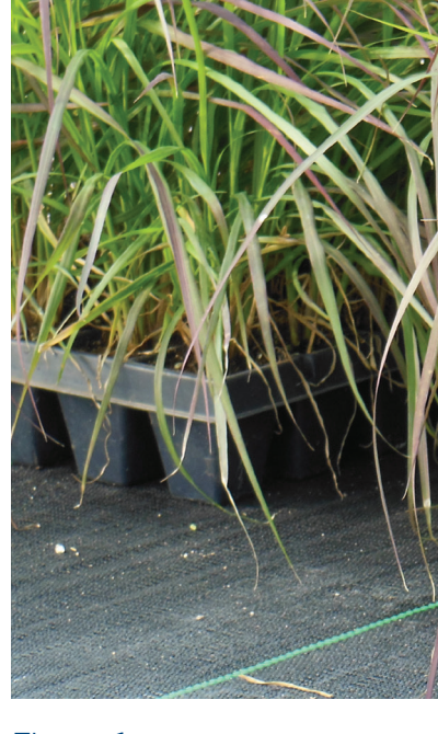
Figure 1. Excessively tall liners of purple fountain grass [Pennisetum ×advena (formerly known as P. setaceum 'Rubrum')].

and quantify the effectiveness of pre-transplant liner dips and post-transplant liner spray applications of dikegulac-sodium, 6-benzylaminopurine (6-BA), or ethephon to increase the number of culms of vegetatively propagated, single-internode purple fountain grass culm cuttings.