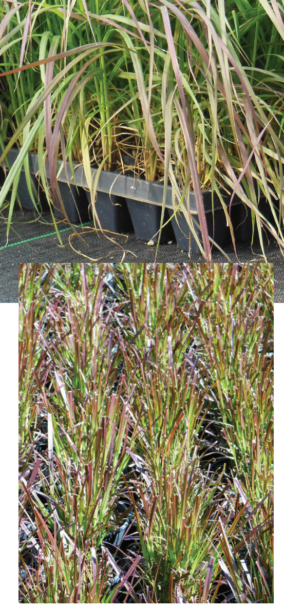
Figure 3. Hand or mechanical pruning is commonly practiced by growers to control height and promote tillering (branching).

environmental conditions, plant cultural procedures, and PGR spray application rates similar to those used for the PGR liner dips. In this experiment, rooted single-internode culm cuttings of purple fountain grass were transplanted and grown for 12 days before a post-transplant PGR spray application or pruning was performed. During the six weeks, average daily air temperature and DLI were 73°F and 24 mol·m-2·d-1, respectively.